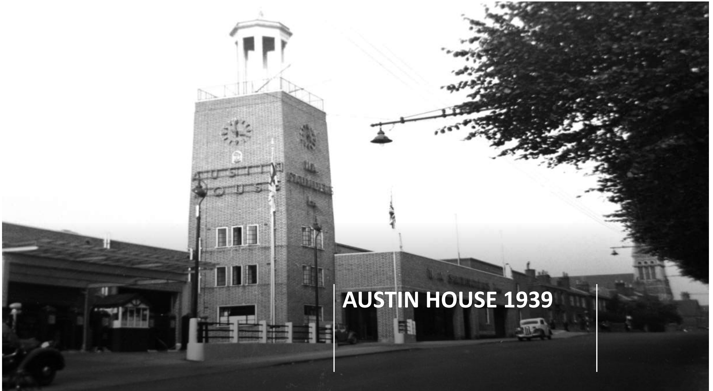
AUSTIN HOUSE 1939