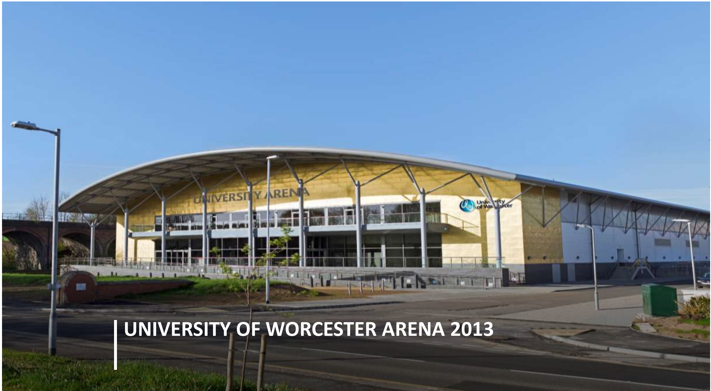
UNIVERSITY OF WORCESTER ARENA 2013