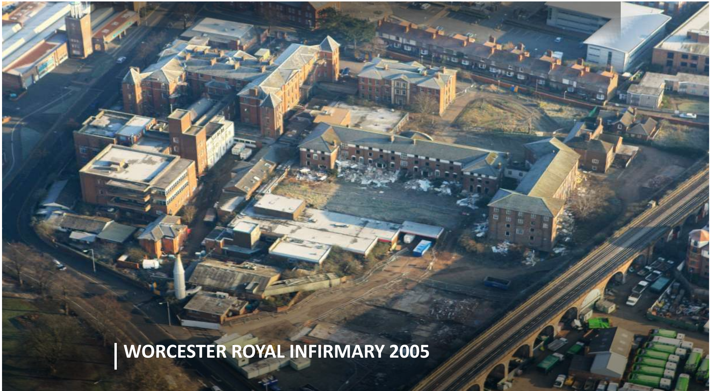
| WORCESTER ROYAL INFIRMARY 2005